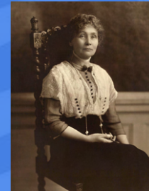
Emmeline Pankhurst Champion of Gender Equality