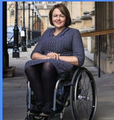
Tanni Grey-Thompson Champion of Disability Equality

Bevan House 385 Thompson House 353 Stephenson House 422 Pankhurst House 486