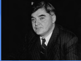
Nye Bevan Champion of Wealth Equality