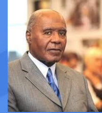
Paul Stephenson Champion of Racial Equality

Bevan House 385 Thompson House 353 Stephenson House 422 Pankhurst House 486