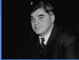
Nye Bevan Champion of Wealth Equality