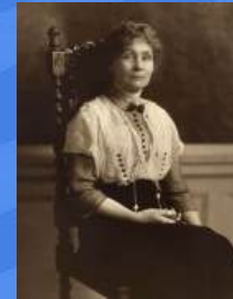
Emmeline Pankhurst Champion of Gender Equality