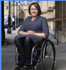
Tanni Grey-Thompson Champion of Disability Equality

Bevan House 230 Thompson House 575 Stephenson House 233 Pankhurst House 357