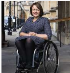
Tanni Grey-Thompson Champion of Disability Equality