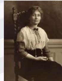
Emmeline Pankhurst Champion of Gender Equality