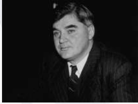
Nye Bevan Champion of Wealth Equality