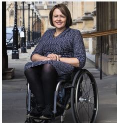
Tanni Grey -Thompson Champion of Disability Equality