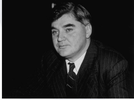
Nye Bevan Champion of Wealth Equality