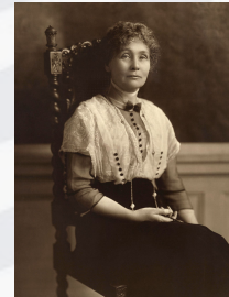
Emmeline Pankhurst Champion of Gender Equality