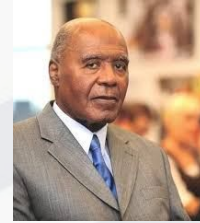
Paul Stephenson Champion of Racial Equality