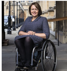
Tanni Grey -Thompson Champion of Disability Equality